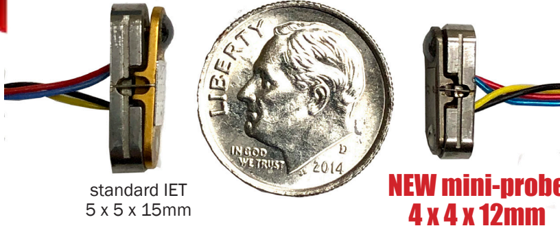
standard IET 5 x 5 x 15mm

Check Bores, Grooves & the Narrowest of Surfaces Directly with this Super-Tiny Transducer